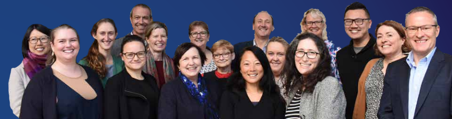
Strategy Day 2022

The PC4 team often dedicates the last five minutes of team meetings to our achievements in the past week and what we will achieve in the coming week. So, looking back and looking