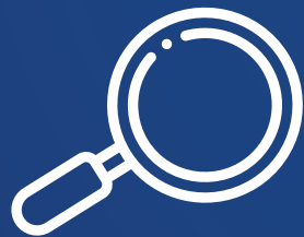
RESEARCHERS NON SPECIFIC